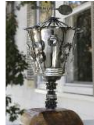
Birdhouse by Pierre Lahaussais

Birdhouses are a safe haven for birds on a journey. Though seldom their final residence, the birdhouses provide temporary, protective shelters for birds in transition. Such is Project Return: a way station for troubled girls while they repair their lives and find their wings, ultimately to make their way back home to a more settled life.