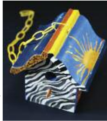
Birdhouse by Eileen Carnes

For more information about Project Return or the Birdhouse Auction, call 203-291-6402, or view the website: www.projectreturnct.org .