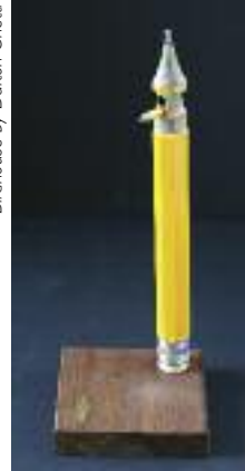
Birdhouse by Dalton Ghetti

Complete your birdhouse and deliver it to the birdhouse committee anytime before the deadline: Feb. 1, 2010.