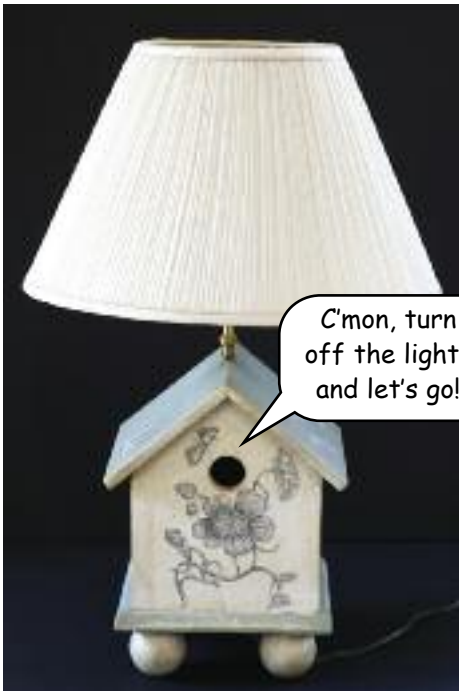
Birdhouse by Nash Hyon

Deadline to deliver Birdhouses: Feb. 1, 2010